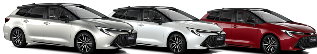
Precious Silver Bi-tone (2RD) ***