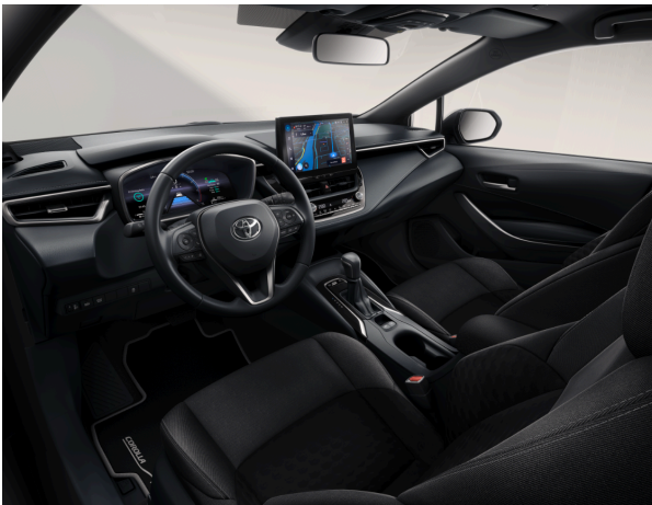
Dark Grey fabric (FB21) (Luna)