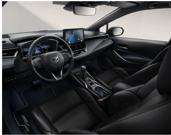
Recycled Fabric Samara & Dinamica (EB21) (Sol)