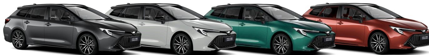
Ash Grey Bi-tone (2MB) **