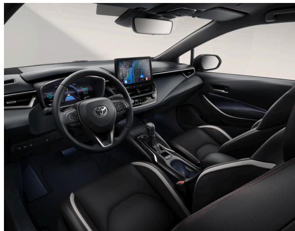
Grey fabric with black leather-like bolsters & satin chrome ornament (FC21) (GR Sport)