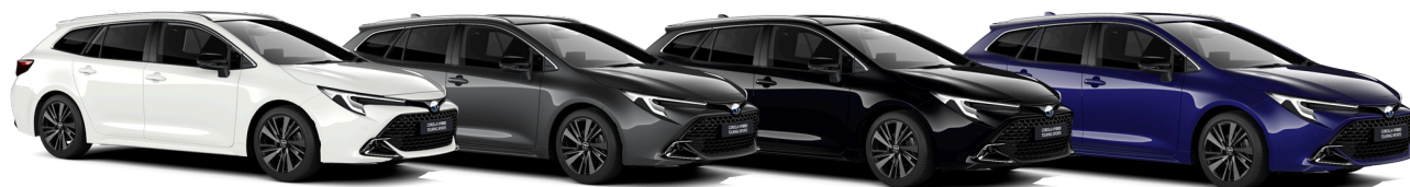
Pure White (040) *