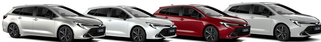
Precious Silver (1J6) ***